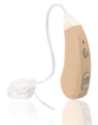
Rx8 Hearing Aids