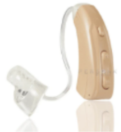
Rx4 Hearing Aids